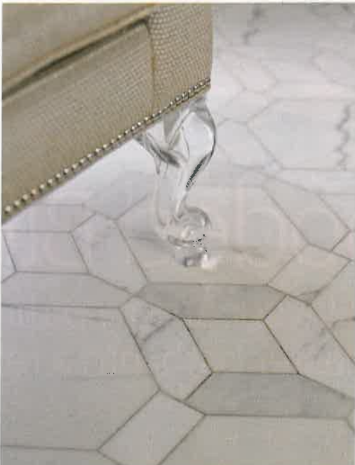
Opposite: A hallway leading from the master bedroom offers access to separate closets, the shower, and a toilet compartment. Designer Bill Stewart included two niches across from each other to hold sculptures and break up all the marble. Top left: Decorative insets featuring hexagonal marble tiles distinguish the glamorous shower. Top right: A built-in bench adds comfort in the shower. Above: Separate vanities are customized for each homeowner. Jack Halpern’s side of the bathroom includes medicine cabinets hidden behind the mirrors. Above right: Mirrors above the countertops open with a touch for extra storage. Right: Hexagonal marble tiles on the floor are subtle yet elegant. “Using square white marble tiles just wasn’t special enough,” bath designer Matthew Quinn says. Far right: Pretty perfume bottles and fresh blooms decorate Lynn’s makeup table.

DESIGNER INSIGHTS Displaying Art in a Bath “I like the surprise of having art in the bathroom,” interior designer Bill Stewart says. Personally chosen paintings and sculptures help offset cool, hard surfaces. What to keep in mind: • Humidity. In a humid environment like a bath, works on paper might not be ideal because moisture could cause them to wrinkle. Paintings on canvas or any sculptures made of hard materials should be fine. • Space. Plan ahead to include dedicated display space for cherished works of art. The sculpture niches in this bathroom, for example, were included during the layout stage. • Subject matter. Displaying art in a private space gives you license to be creative. “This is the place to use that art you like but don’t quite know where to put,” Stewart says. You’ll see it every day, but your guests will not.